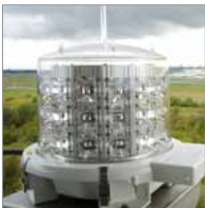
LED Obstruction Light