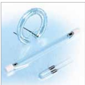
Xenon Flash Lamps for Emergency Lighting and Warning Beacons